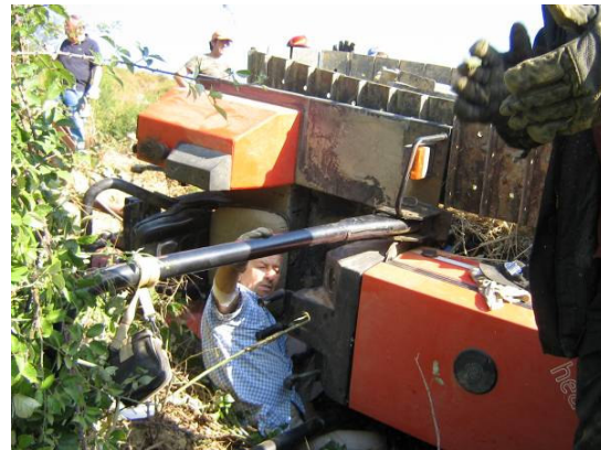
Figure 3. Accidents with conformed tractors equipped with ROPS and retention belt don't have heavy injuries for operators in almost all cases

In the specific case of small tractors have been taken into account the following risk cases: limbs capture or crushing, tractor rollover caused by heavy carried equipment, overload in pulling, extreme transversal slope, transversal skid, uncontrolled kynematisms between tractor and equipment, unexpected release of gear, unexpected autonomous start of machinery, immoderate forward speed or fast manoeuvre.