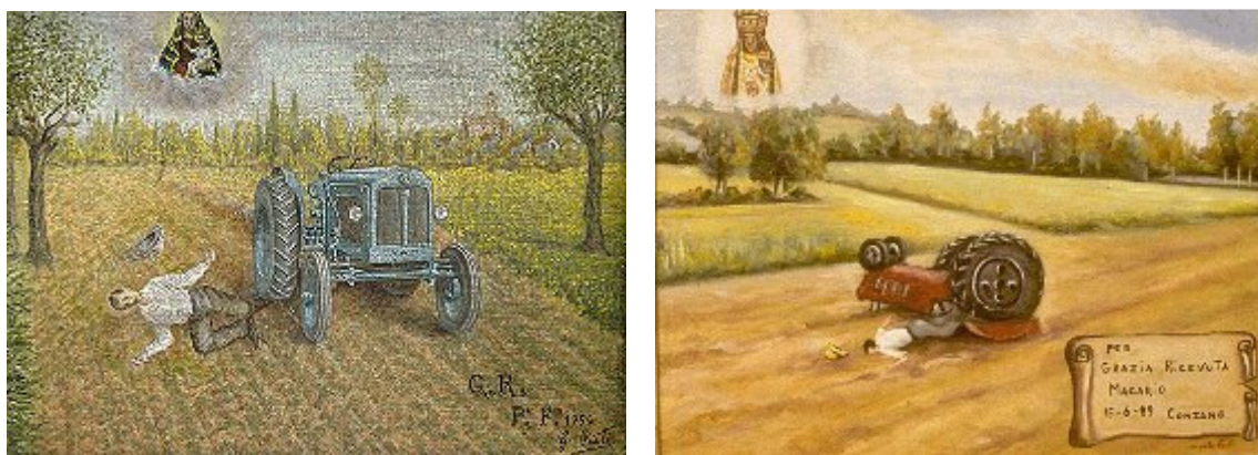
Figure 1. Accidents and risks in agricultural machinery use have always been well known as represented in the ( ex voto ) exposed all over in Shrines. But this know-how is no longer owned by the new farmers who work occasionally without experience and with often old and not reliable machinery

Risk level is increased by many factors: low information on machine or plant works; use of material, machine and process unsuitable for the specific work or situation; low training on the correct drive and behaviour in the specific situation; lack of correct procedures in agricultural machine use; fixing machine components; lack of correct maintenance; being careless, tired, in a hurry, having too much confidence with machines . (Figure 1)