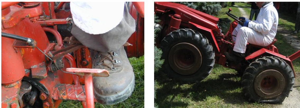
Figure 5. 4WD small tractor: typical case of capture (see the shoelace) and case of tractor rear up pulling something

The program of these meetings is organized as follows: accidents analysis in agriculture with particular attention to Tuscany activities, risk cases analysis, controls and procedure to mitigate risks in agricultural activities, legislative approach, norms, responsibilities and actors.