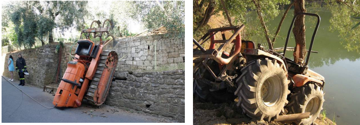
Figure 4. Oversights could have funny results but at the same time very dangerous

All this informative multimedia supports are illustrated and delivered during meeting carried out on the whole Tuscany areas.