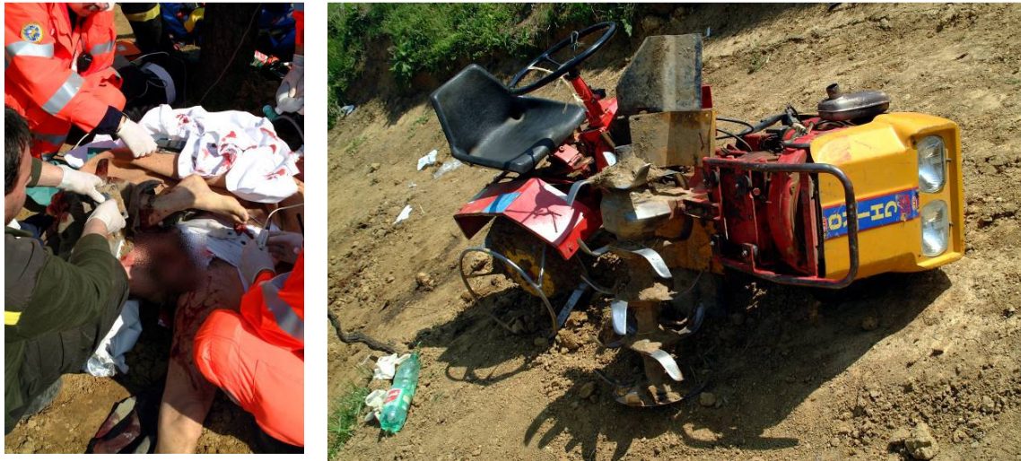
Figure 6. Motor hoe tractors provoke usually heavy and permanent injuries

Dealers of agricultural equipment have great responsibility in training operators for safe use of machinery for their opportunity to meet frequently the farmers.