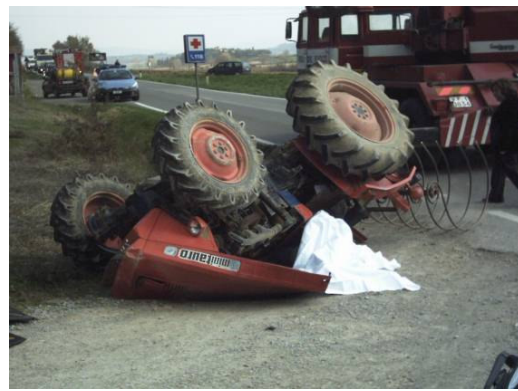
Figure 2. Old tractor without ROPS (Rollover Protective Structure) are cause of mortal accident. Inefficient brake system and lack of assisted-aid systems characterize these machines